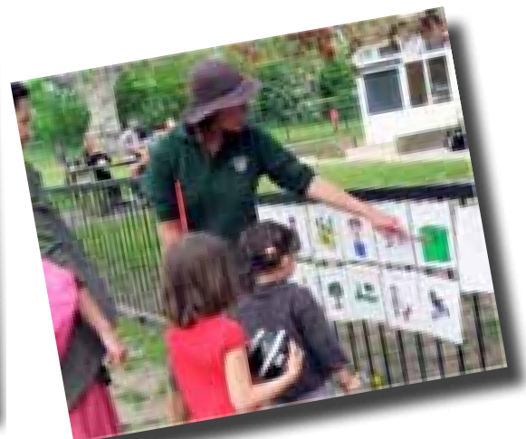
Working with communities