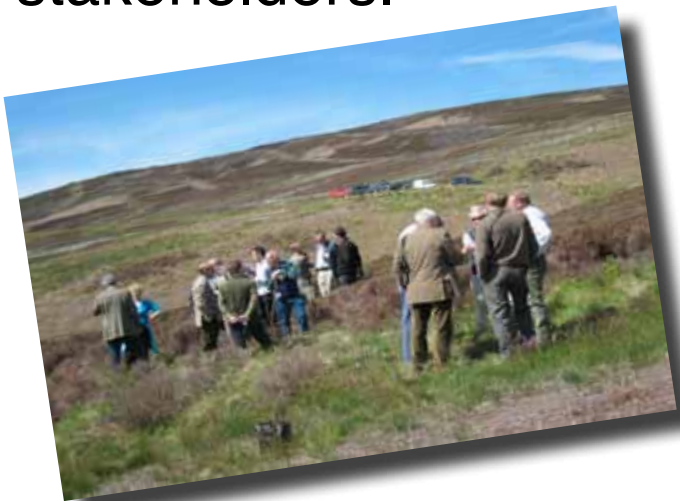
Bringing together people in your communities to make well-informed decisions about resources

The Environment Council (TEC) is the leading charity focusing on stakeholder engagement to deliver a sustainable future. We apply the Principles of Authentic Engagement to achieve the best outcomes for you and your stakeholders.