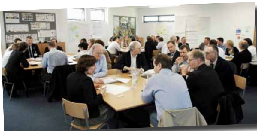
Getting your stakeholder engagement an A+ rating